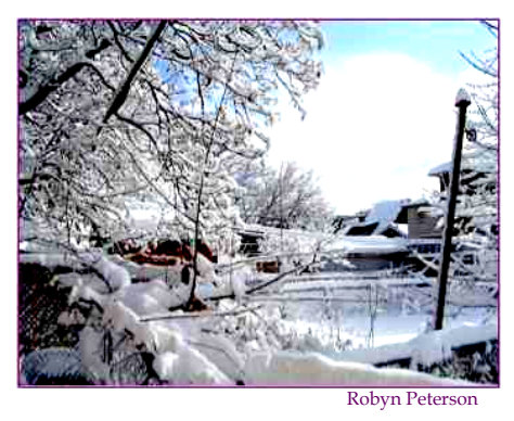
Snow? ... in Canada?