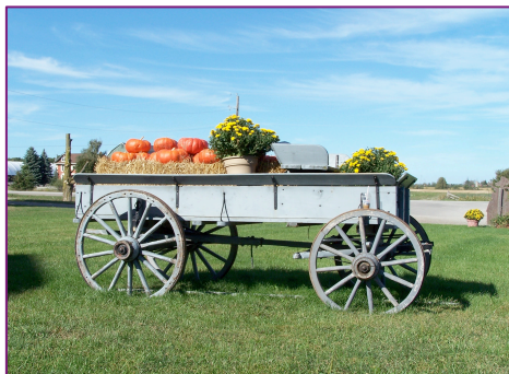
Roll out the wagon of bounty