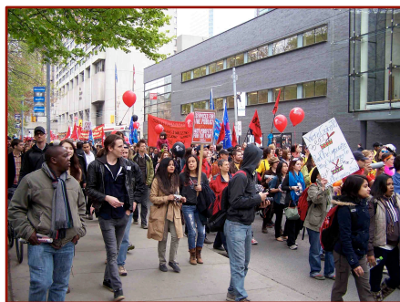
May we have some action please?

More than ever alert citizens need to think deeply about what politicians and business leaders are saying. How much of the information fed to us with lots of light and sound is actually agnotology produced to further a particular purpose, a purpose we might not actually agree with?